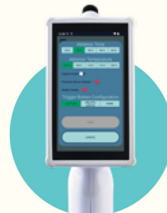
User adjustable settings for time and temperature of treatment cycle

Liger strives to be cutting edge. Future projects include cloud based storage and AI for automated visual evaluation of the cervix. All IRIS devices will be able to receive updates when connected to wifi.