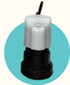
4 hours of use per charge