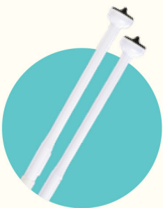
Heated probe tip