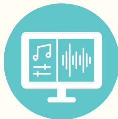
Audio and visual safety cues.